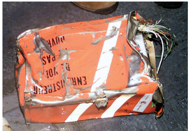
MEMENTO MORI: This black box alone was left to tell the story of the crash of EgyptAir Flight 990.

The information recorded, the sampling rate, and the order in which the data are stored differ. The manufacturers supply the software and hardware needed to read and analyze the data and sometimes send representatives to help interpret them. They may have their work cut out for them if the box is dented, twisted under high heat, or has damaged cable interfaces. In